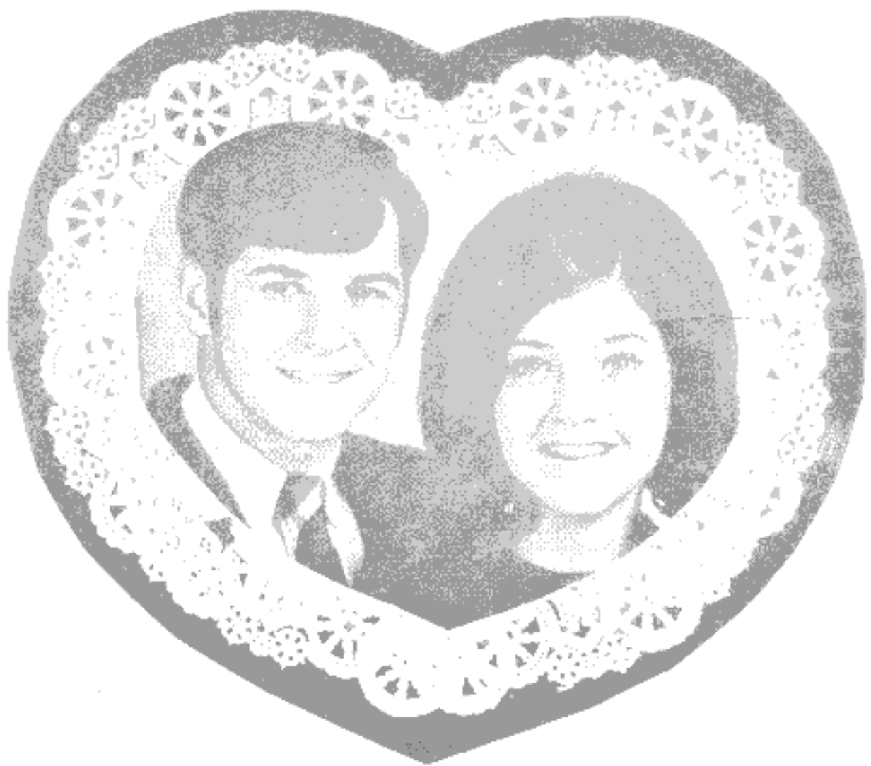
King And Queen Of Hearts