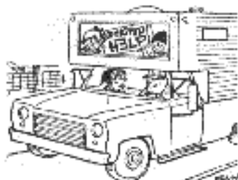
"Better stop and let me check the kids--we're getting stans again."