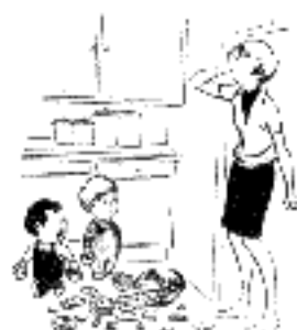
"I think it better if my mother cut up with me for awhile."