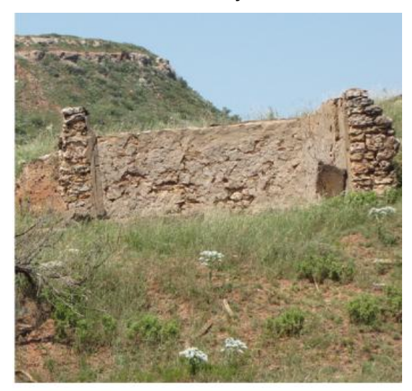
Remains of Callaway Basement at Heman

They dug a basement into the embankment with the back side opening toward the river and lined it with native stone. They then built a two-room frame house on top of the basement and anchored it