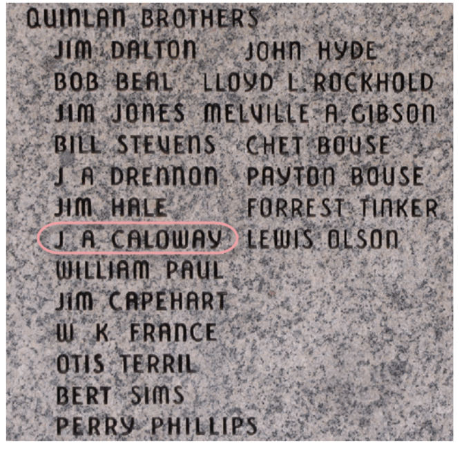
Old Cowhands Monument Freedom, Oklahoma