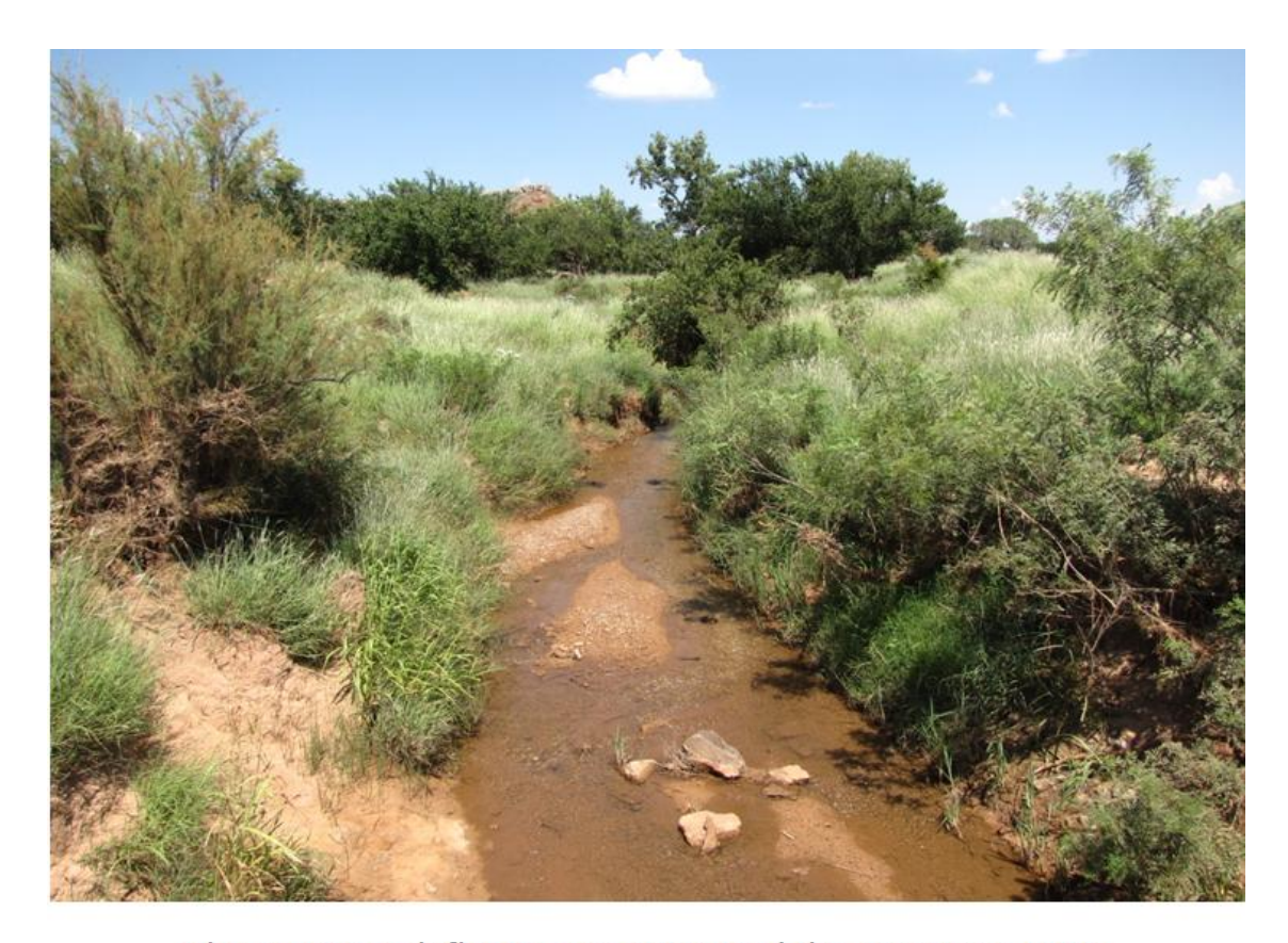
Chimney Creek flowing west toward the Cimarron River

On the western plateau behind the escarpment, the ruggedness of the land continues. Known as the Ragged Hills , the landscape consists of a series of sometimes rolling and sometimes steep sided hills interspersed with large rolling plains that extend west for twenty or more miles.