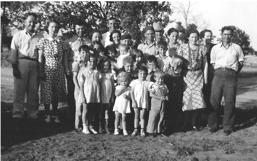
Bunches of Blairs, Osborns, Hunts, Endres, Wings, late '30s

The children marry and have 27 children of their own.