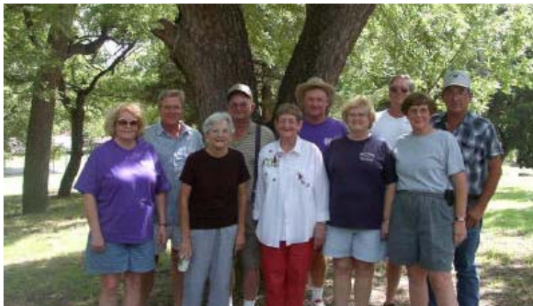
Hunt reunion 2002 with all 10 children