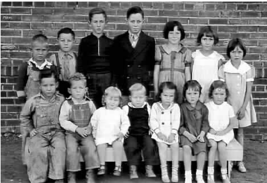
A grandchild lineup in the late 1930s: 14 and 12 more to come