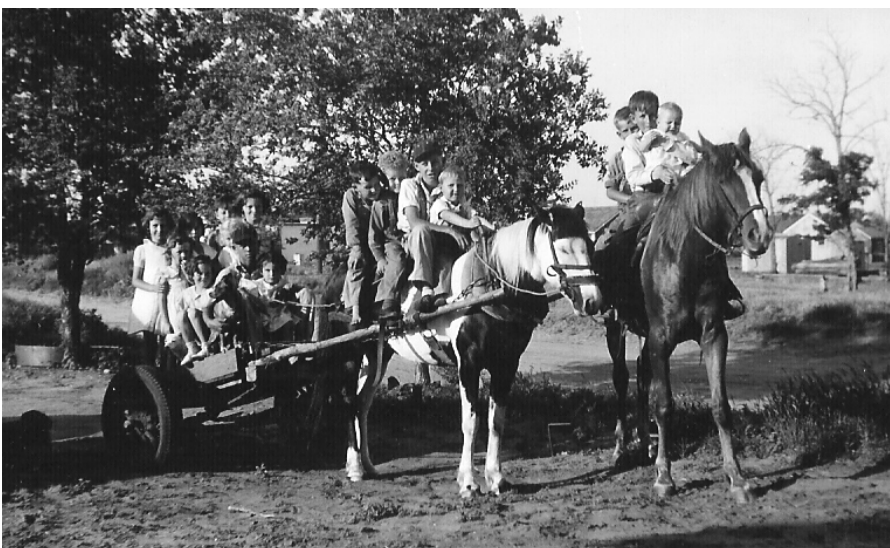
Trixie the pony with a cartload of grandchildren and 3 on a horse