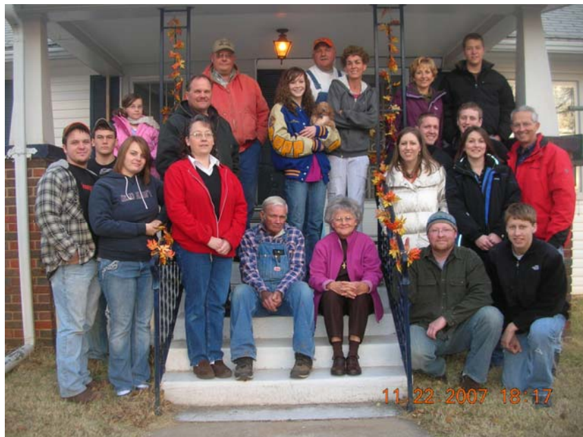
Some Blair Cousins with children and grandchildren at Happy Hollow, November 2007