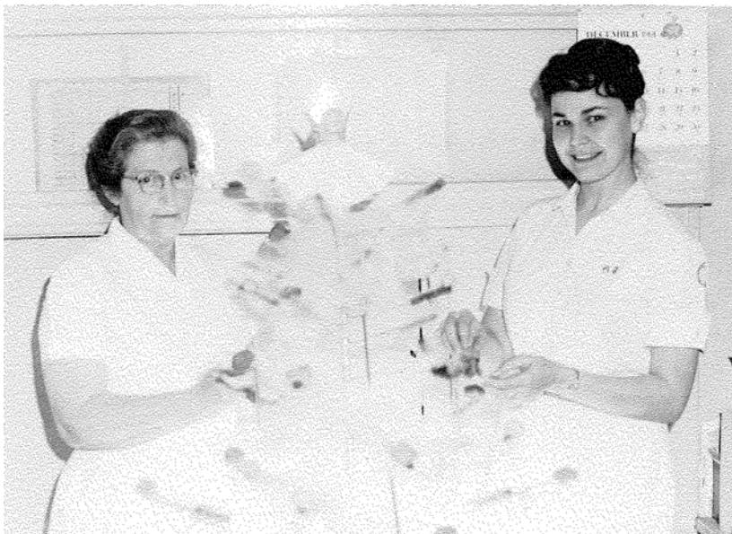
Madge with a fellow hospital worker